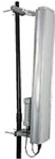
Figure 1: Internet Distribution Antenna (one of four located near tower top)

Dimensions: Length 33 inches. X width 6.5 inches