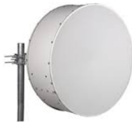
Figure 2: Dish Antennas for Internet Backhaul Link (one of two)

Mounted above tower midpoint. Diameter: 1 at 48", 1 at 72"